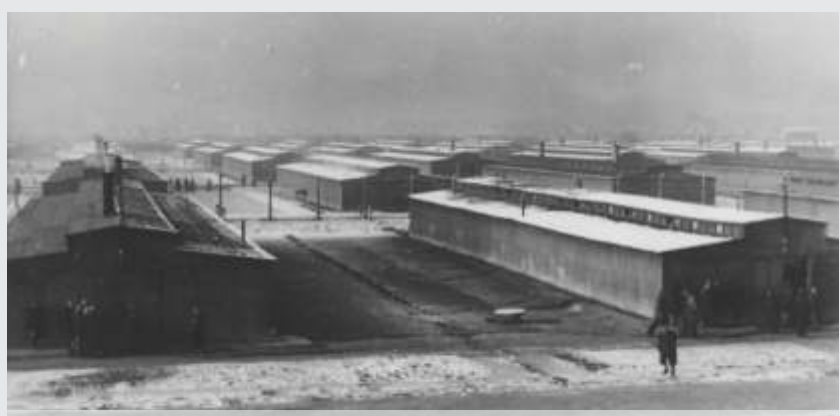
Sector Blle: the "Gypsy camp" at Auschwitz-Birkenau